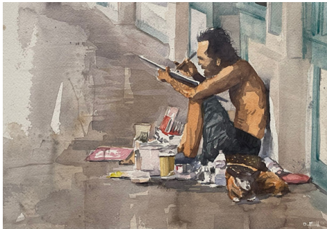
Hilo Street Artist