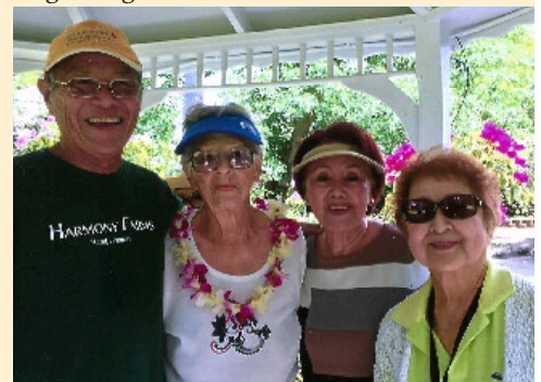
Friends at Foster Garden