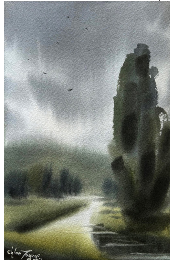
Chloe Tomomi, Soothed