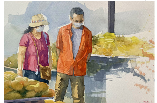
Hilo Farmers Market

but all of the large work is done back in the studio upon my return.