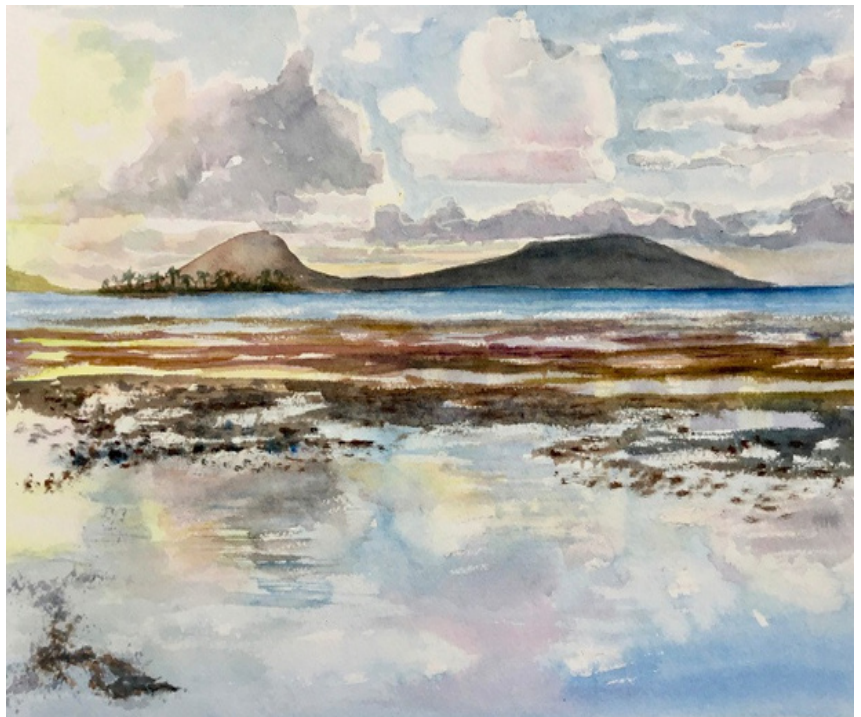
Sherry Cavin, Sunrise over Maunaloa Bay