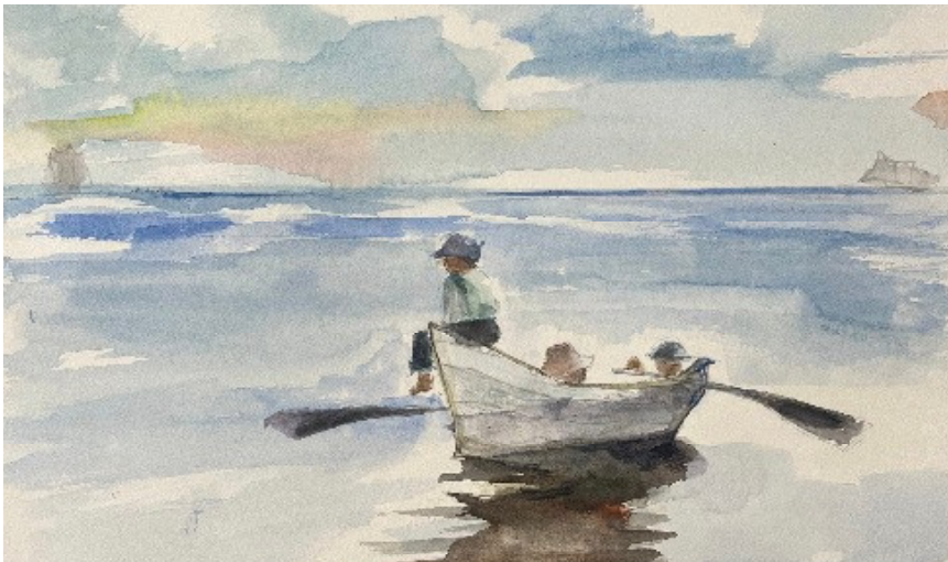
On my boat