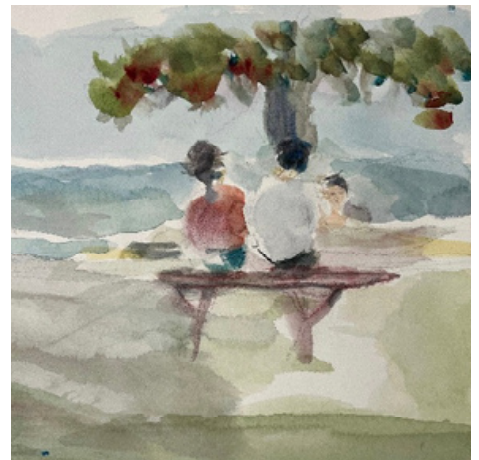
At the beach